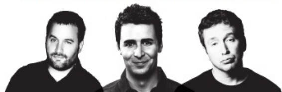
Tom Segura Pete Lee Chad Daniels